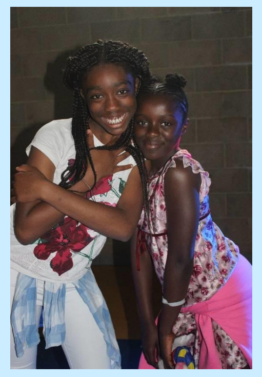
Evening Entertainments Camp Fire Capture the Flag And many more