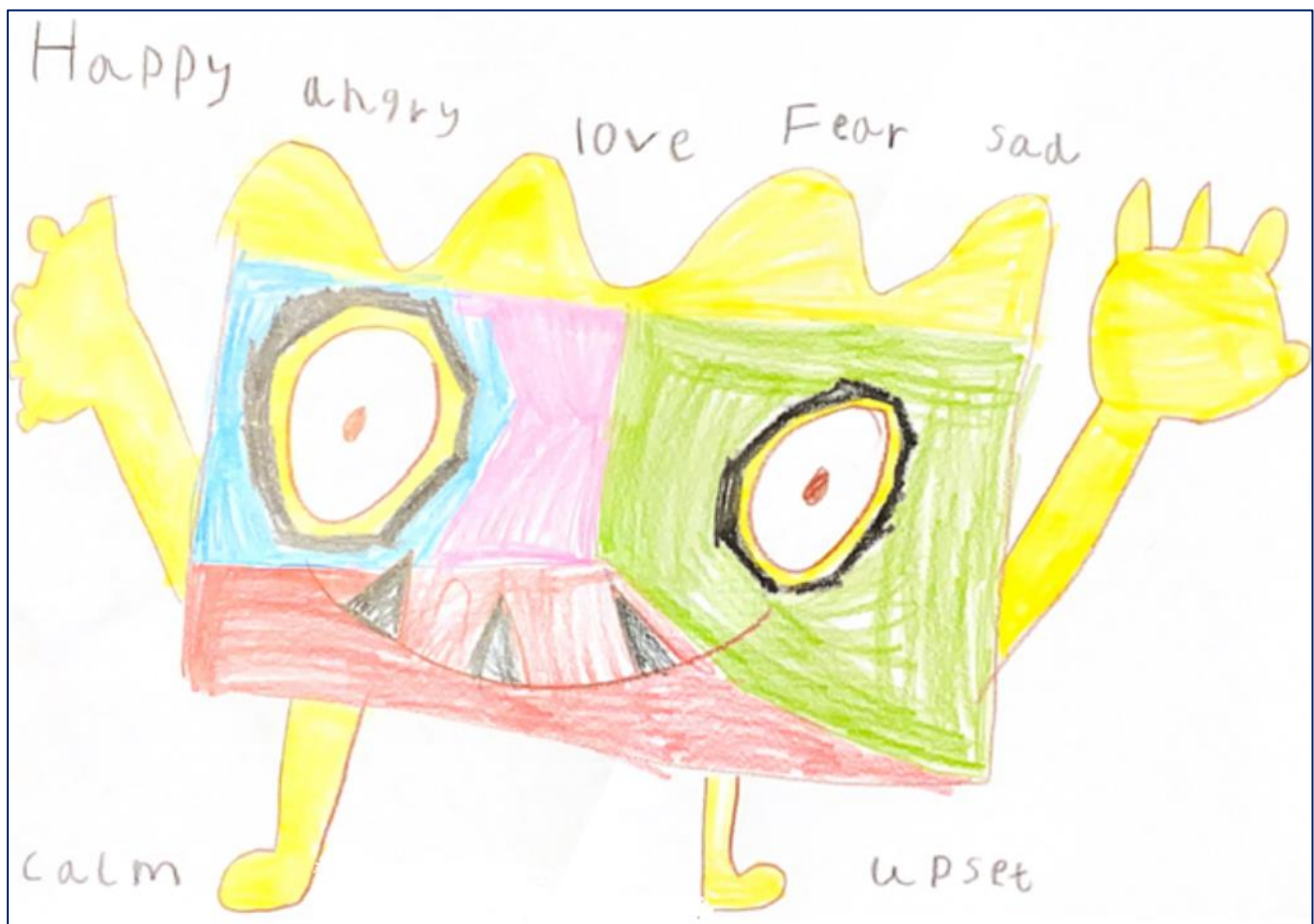
Colby, age 6

A joined-up approach to support the emotional wellbeing and mental health of children and young people