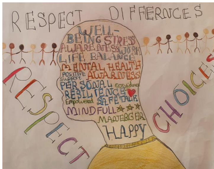
Jessica, age 10

Emotional wellbeing and mental health mean different things to different people. We all have mental health and we must look after it, getting the right support at the right time.