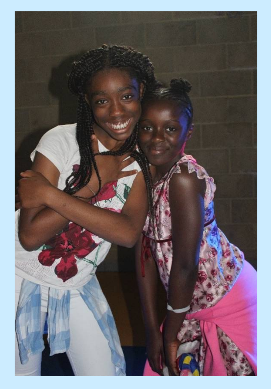
Evening Entertainments Camp Fire Capture the Flag And many more